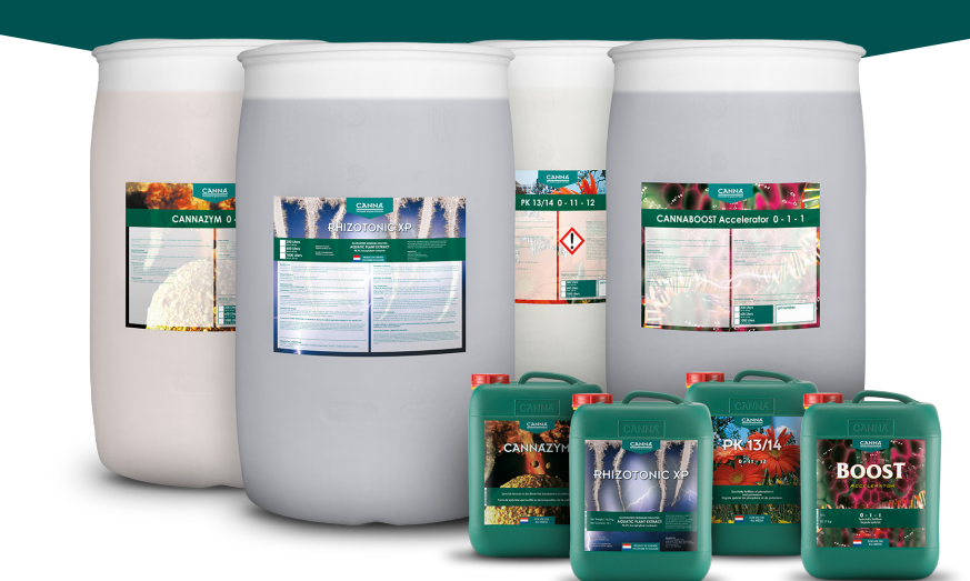
CANNAZYM - CANNA RHIZOTONIC XP - CANNA PK13/14 - CANNABOOST