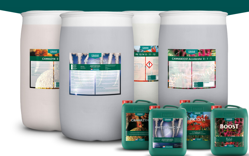
CANNAZYM - CANNA RHIZOTONIC XP - CANNA PK13/14 - CANNABOOST